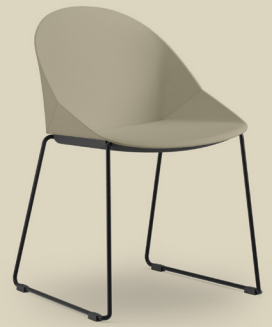
Skid Base Shell Only