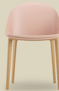
4 Wood Effect Legs Seat Pad