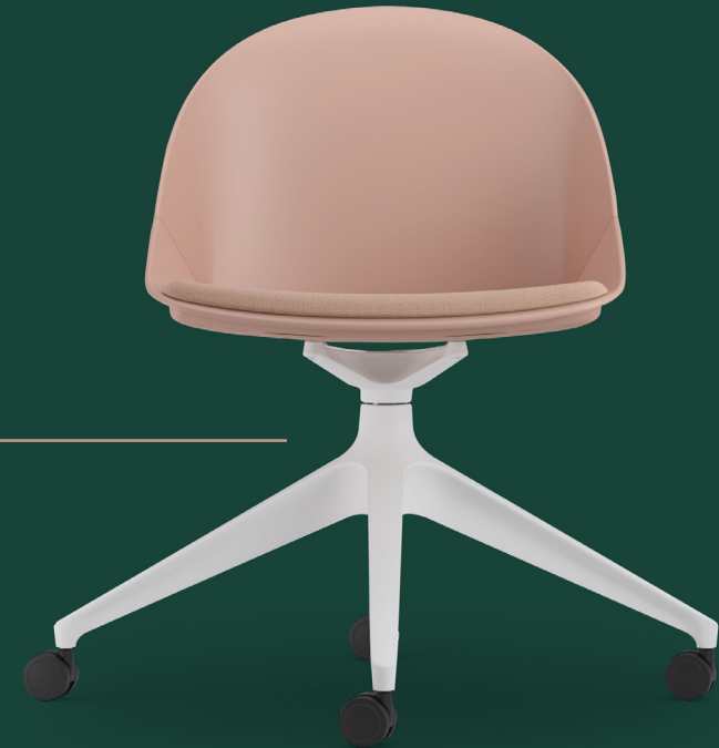
Raised Base with Castors