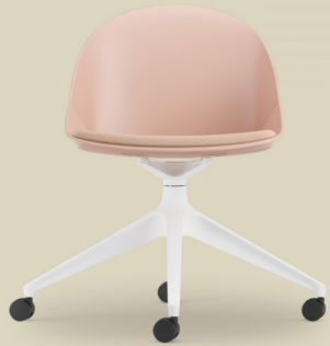
Raised Base with Castors Seat Pad

upholstered seat, the Papillon chair is truly adaptable to all types of interior designs.