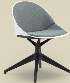
Raised Base Inside Upholstery