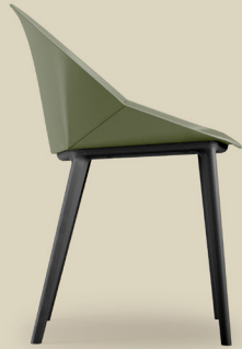
100% Recycled Chair Shell Only