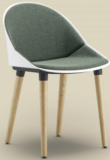
4 Wooden Legs Inside Upholstery