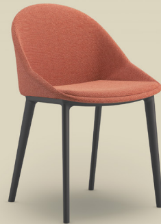
4 Plastic Legs Fully Upholstered